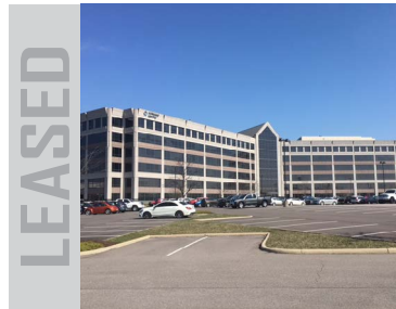
5181 Natorp Blvd Cincinnati, OH 29,240 SF