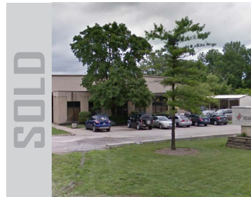
3370 Port Union Road Fairfield, OH 21,600 SF