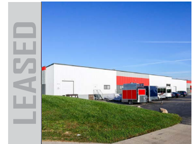
5150-5154 Duff Drive West Chester, OH 12,000 S