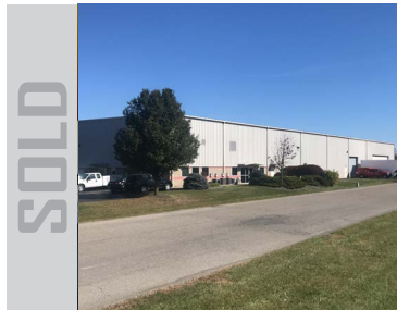
400 Wright Drive Monroe, OH 43,200 SF