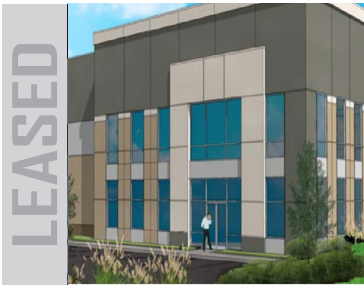
8586 Trade Center West Chester, OH 195,866 SF